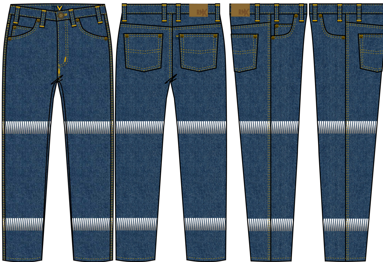
Stone Wash Denim Blue