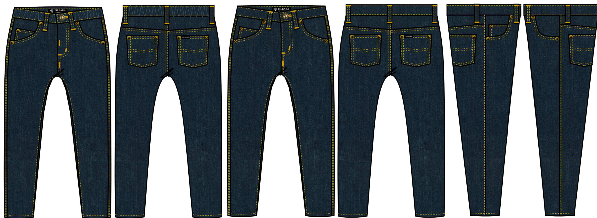
Indigo Blue with Hand Make Distressed Look