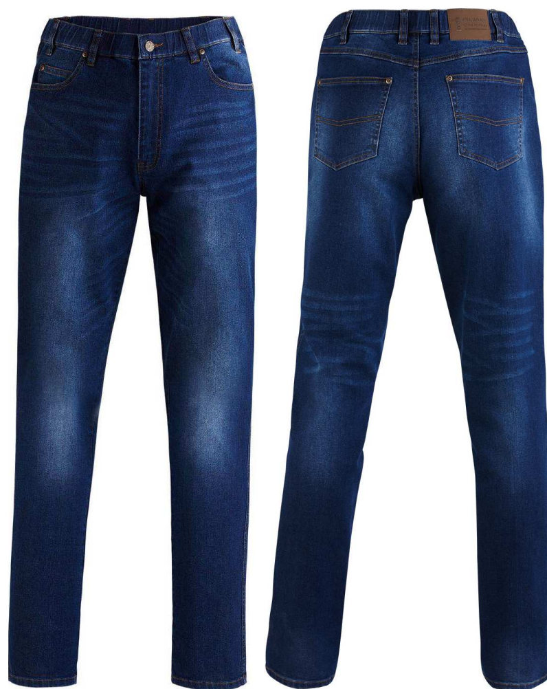
Indigo Blue with Hand Make Distressed Look

Size Range 72R – 112R 87S – 142S 79L – 94L